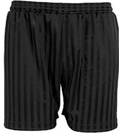
BLACK UNISEX SHADOW STRIPE PE SHORTS