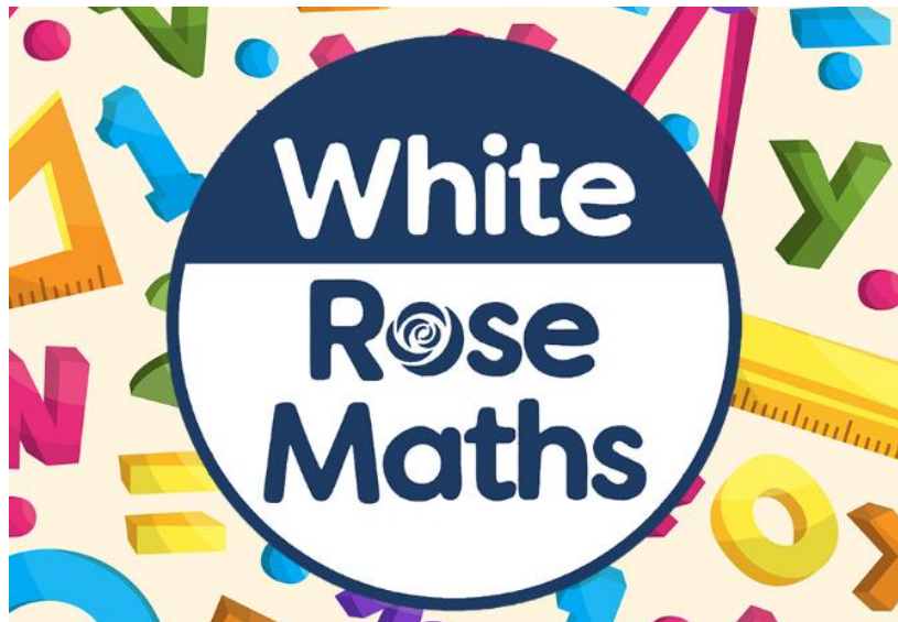
WRM - Year 5 - Scheme of Learning 2.0