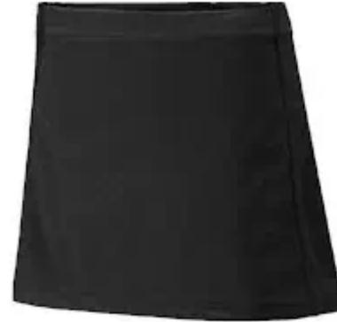
BLACK SKORT (G203)