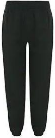
BLACK JOGGING BOTTOMS